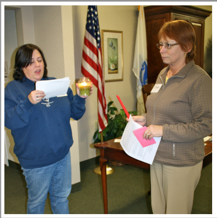
A6 Friday, January 14, 2011 ■ TauntonGazette.com ■ Taunton Daily Gazette