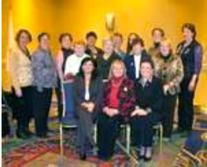
Mid Winter Meeting