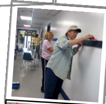
Advocates for Children