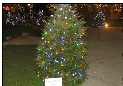
THE CHRISTMAS CITY 2011