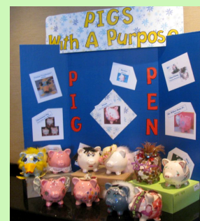
PIGS WITH A PURPOSE

Bring a gift, get a gift. Surprise someone and yourself with a small gift in return.