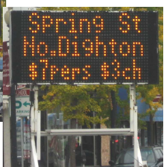
Electronic Sign on the Green (Didn't capture the date & time sign)

A member of the General Federation of Women's Clubs International: www.gfwc.org