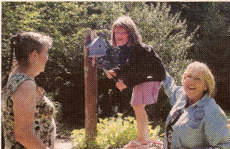
SILVER CITY BULLETIN