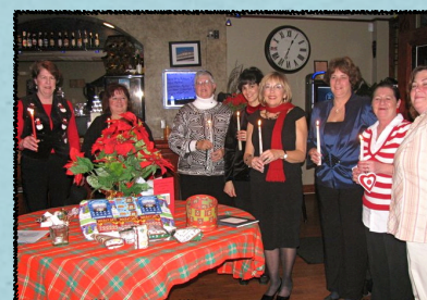
OUR 2011 BOARD INSTALLATION

Bring a gift, get a gift. Surprise someone and yourself with a small gift in return.