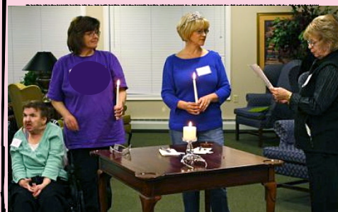
OUR NEW MEMBERS

Bring a gift, get a gift. Surprise someone and yourself with a small gift in return.