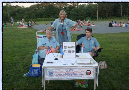
DIGHTON PUBLIC LIBRARY