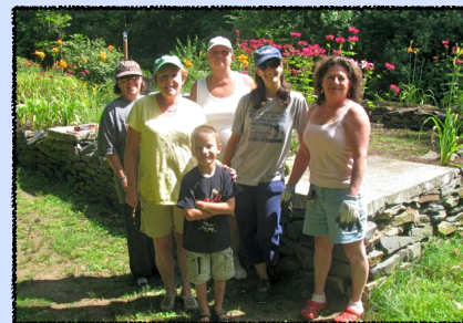
BOYDON FRAGRANCE GARDEN

Bring a gift, get a gift. Surprise someone and yourself with a small gift in return.