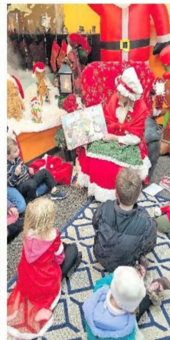
The children received candy canes, cookies and could write a letter to Santa to be mailed to the North Pole in time for Christmas.